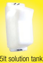
15lt solution tank