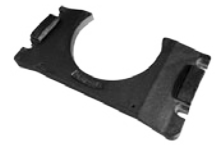
Additional 9kg weights. (Up to 2 per machine)