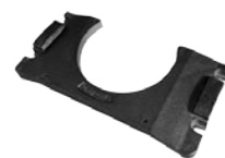
Additional 9kg weights. (Up to 2 per machine)